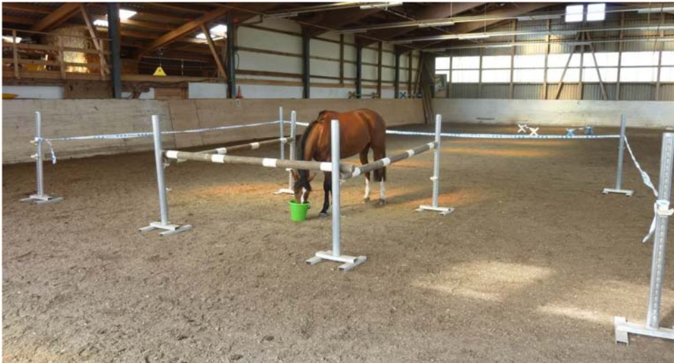
Figure 2. Horse feeding from the rewarded bucket after successfully completing the detour task.