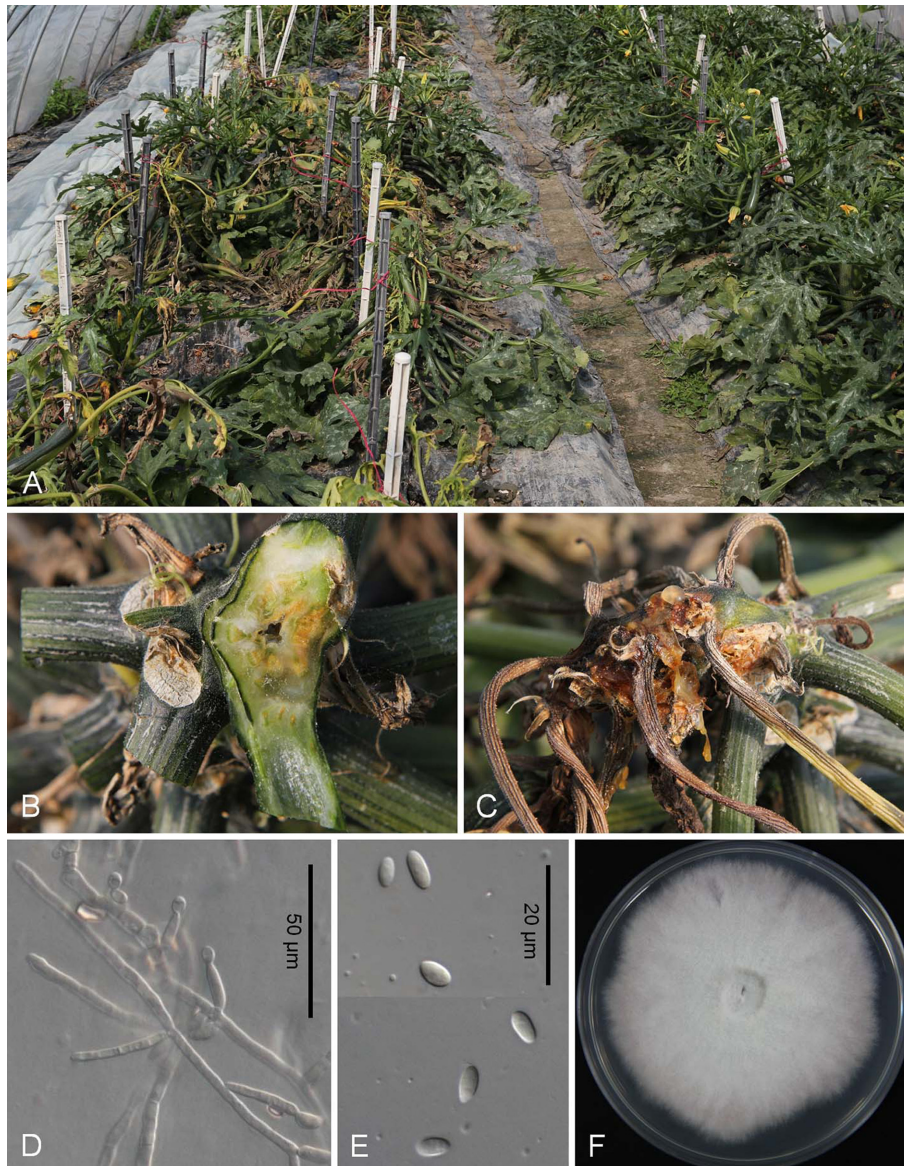
Fig. 1. Fusarium wilt caused by Fusarium oxysporum on zucchini (cv. Taeyang). A, The leaves and stems were infected, devastating the whole plants. Note severe infection on the left bed; B, The vascular system was blocked by the fungus; C, Dark streaks on an infected plant; D, Monophialides with microconidia on hypha; E, Microconidia; F, One-week-old colony of F. oxysporum growing on potato dextrose agar.

For the pathogenicity test, 10 zucchini seedlings (cv. Taeyang) were inoculated with the pathogen by dipping the roots into a conidial suspension ( 2 \times 10^5 conidia/mL). Another 10 seedlings serving as controls were processed similarly by dipping the roots into sterilized distilled water. The plants were retained in a humid chamber for the first 48 hr and then maintained in the greenhouse with 80% relative humidity at 25 \pm 2^\circ\text{C} . Three days after inoculation, wilt symptoms started to develop in the plants. This led to etiolation and vascular discoloration seven days post inoculation; these symptoms were identical to those originally observed in the plastic greenhouse. F. oxysporum was reisolated from the inoculated plants and it satisfied Koch's