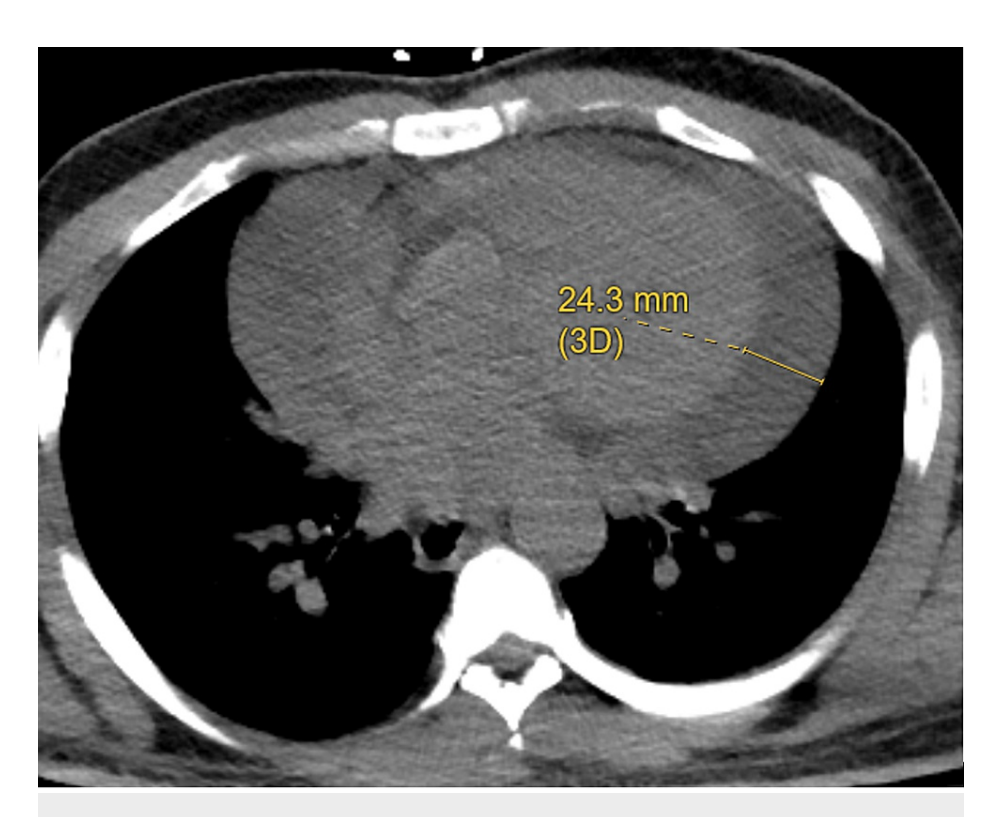
FIGURE 2: Computed Tomography Chest

Pericardial effusion of 24.3 mm (3D) shown on computed tomography chest imaging. D: dimension.