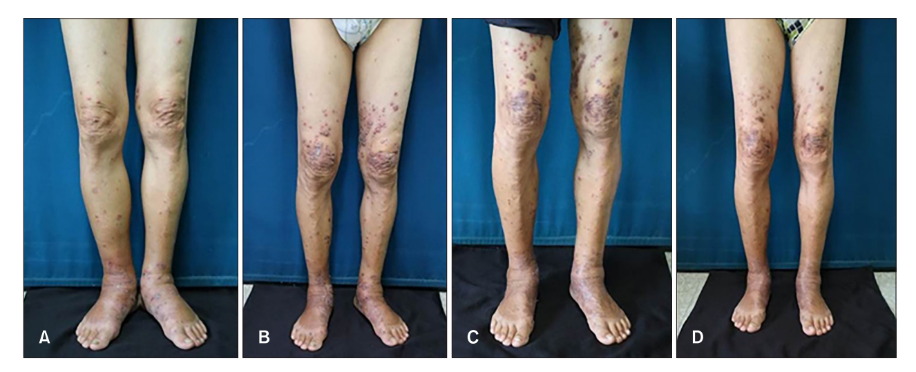
Fig. 1. Serial clinical images. (A) Skin lesion at initial visit featuring multiple red to violaceous papules and plaques with severe oozing and edema on the feet, leukocyte count (63,500/mm³) (B) Aggravation of skin lesion after dosage reduction of hydroxyurea (hydroxycarbamide 0.5 g) leukocyte count (113,000/mm³) (C) Aggravation of skin lesion despite initial dosage of hydroxyurea (hydroxycarbamide 1 g) leukocyte count (98,150/mm³) (D) Improvement of skin lesion after double of initial hydroxyurea dosage (hydroxycarbamide 2 g) with concomitant improvement of leukocytosis, leukocyte count (22,000/mm³).