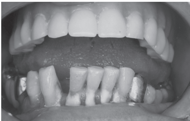
Figure 4 Visible calculus on the labial surfaces of the lower teeth of an older female, due to poor oral hygiene.

Institutionalized elderly with respiratory tract infections have significantly higher levels of dental plaque, containing bacteria that can cause chest infections (Department of Health 2005). Infections originate from dental plaque on unclean teeth and dentures. Poor oral hygiene and the oral microflora have been specifically related to nosocomial ventilator-associated bacterial pneumonia in special-care populations, but there is little evidence of an association between poor oral hygiene and periodontal disease and community acquired pneumonia (Scannapieco 2006). The presence of selected oral disorders (edentulous with defective denture bases or generalized stomatitis and dentate with visible calculus (Figure 4), generalized gingivitis, and teeth with pulpal exposures) associated with low serum albumin ( <35 g/L) increased the relative risk of respiratory tract infection to 3.2 (1.5–6.7), while it was 1.9 among subjects with oral problems and ALB > 35 g/L (Mojon et al 1997). The incidence of respiratory tract infection in frail institutionalized elderly was greater among dentate subjects and those who consulted a dentist in emergency (Mojon et al 1997). Preventive dental care is important in preventing serious lung infections in institutional settings (Mojon et al 1997;