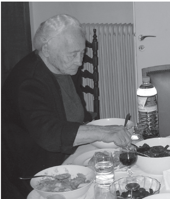
Figure 3 Chewing ability in the elderly is important to maintain a normal social life.

However there are studies indicating that the correlation between masticatory variables and dietary selection is weak in the elderly (Osterberg et al 2002), while the improvement of dentures, or the fabrication of new ones have little effect on dietary selection (Sandstrom and Lindquist 1987; Laurin et al 1992). It is true that food selection is influenced by various factors such as cost, institutionalization, general medical condition, pain, xerostomia, loneliness, income, knowledge, culture, background etc (Heath 1982; Chen and Lowenstein 1984; Kossioni and Karkazis 1999; Sheiham et al 1999; Osterberg et al 2002). Chen and Lowenstein (1984) showed a positive