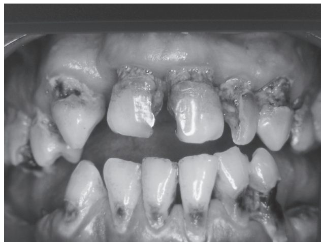
Figure 2 Root caries are common in the elderly.

reflex activity is maintained until very old age (Kossioni and Karkazis 1998). This is probably due to continuous use of jaw muscles for chewing, swallowing, speaking, smiling and to the particular functional role of these reflexes in humans.