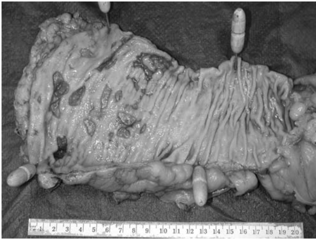
Fig. 1. Formalin-fixed colon showing deep irregular ulcers with sharp edges and a perforation in the lower left area