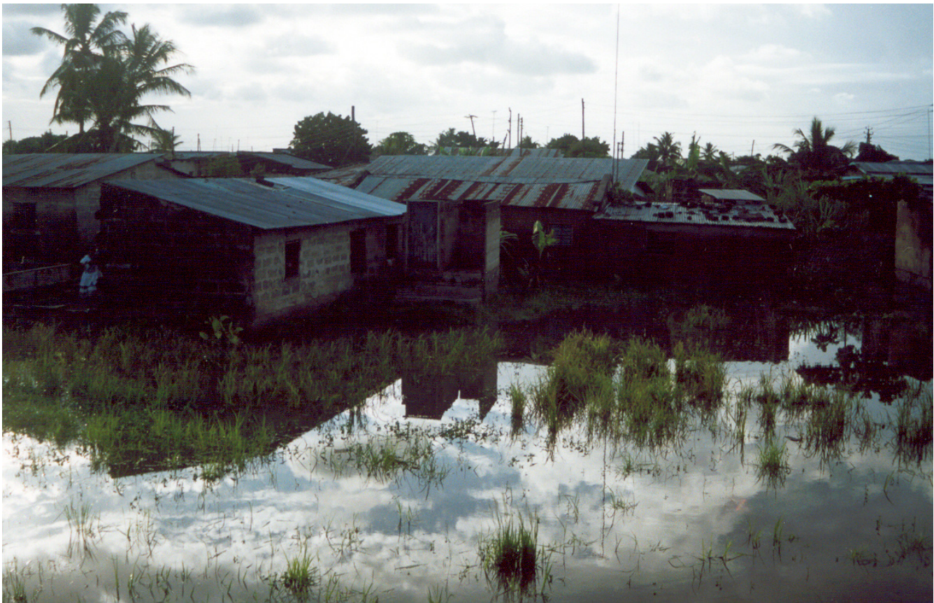
Figure 6 Examples of flooded areas in the poorly planned settlements of Vingunguti in Ilala municipality, Dar es Salaam, Tanzania.

ideal for delivering community-based vector control interventions [15,34,39,87]. This degree of autonomy enabled Ilala Municipal Council to independently conceive, fund and implement a community-based mosquito surveillance programme as an entirely local initiative in early 2002. Supplementing ongoing programmes for social marketing of ITNs and improved access to effective diagnosis and treatment [88], teams of community members were recruited to map and characterize the extensive breeding sites provided by intensive urban agriculture and poorly planned settlement (Figure 6) which abound in Dar es Salaam [76,89] and many other African cities [19,20,90-93]. Weekly surveys for larval and adult mosquitoes were piloted in 7 of the 22 wards of Ilala Municipality as a preliminary step towards IVM by larviciding and environmental management. Furthermore, all three municipal councils had actively promoted a variety of locality-specific community-based environmental management schemes such as trench digging and collection of solid waste refuse to prevent obstruction of such drains (Figure 7). In June 2003 the City Medical Office of Health (CMOH) convened a stakeholders meeting for all con-