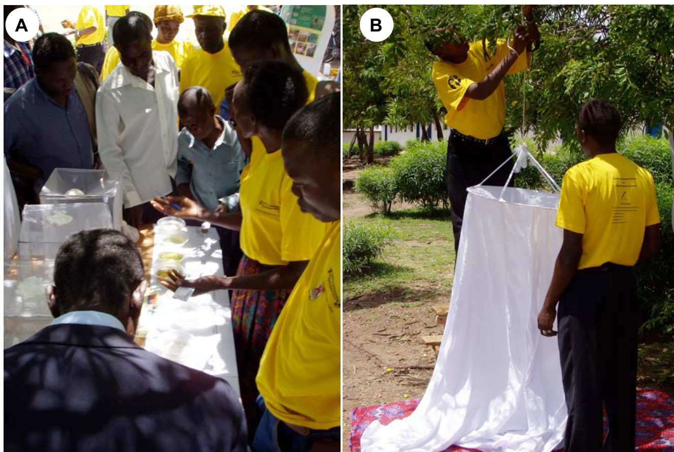
Figure 2 Community members demonstrate the life cycle of mosquitoes (A) and the use of practicable adult mosquito sampling tools (B) at Rusinga Island Child and Family Programme/Christian Children's Fund-Kenya, African Malaria Day, May 2004 on Rusinga Island, Western Kenya.

sustainable changes in behaviour with knowledge transfer from children to adults and between families and friends.