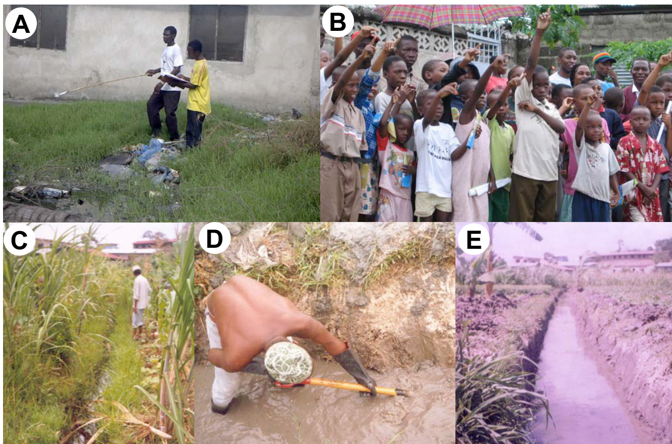
Figure 7 Examples of community-based malaria surveillance and control in Dar es Salaam. A. Community Own Resource Persons mapping and characterizing mosquito breeding sites in Vingunguti ward, Ilala Municipality in May 2004. B. Children participate in a quiz about malaria and mosquitoes in Mchikichini ward, Ilala Municipality, in April 2004. C. Extensive agricultural breeding sites associated with neglected drains adjacent to Ruihinda Primary School (background), Kigogo Ward, Kinondoni Municipality, in June 2001. D. Kinondoni Municipal Council workers rehabilitate the drain to lower the water table in August 2001. E. The same plots in September 2001.

The consensus view of the stakeholders was that it was essential to strengthen the capacity of research and training institutions in Tanzania, within the initial pilot period of the programme, to build the necessary academic support base required to maintain the essential skills base on an indefinite basis. The primary national institutes involved included the Ifakara Health Research and Development Centre and the Department of Zoology and Marine Biology at the University of Dar es Salaam. These institutes were identified as not only supporting institutes but also as targets for strengthening training capacity so that the quantity and quality of applied ecologists available at undergraduate and graduate levels for recruitment to mosquito control programmes could be improved. Although this community-academic collaboration differs considerably from Rusinga in its setting and origins, the partnership has already begun to address capacity deficits by bringing expertise in operational mosquito control to