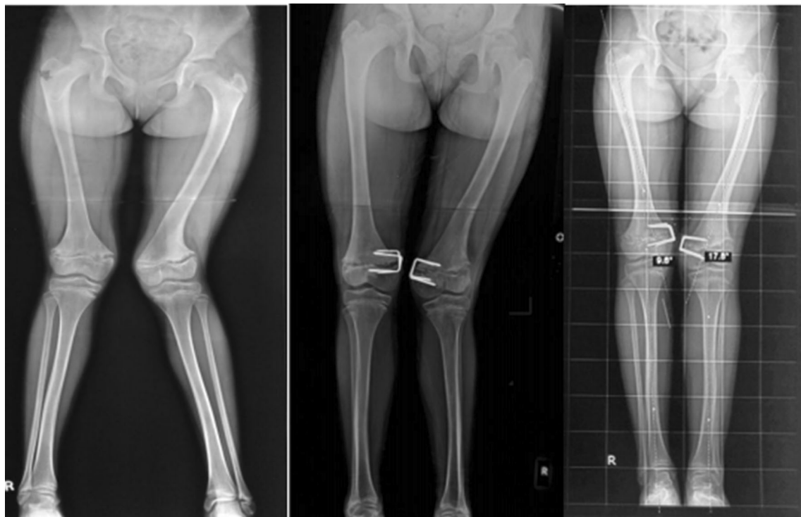
Fig. 2 Radiological correction of deformity at 4-monthly intervals with staples

Forty patients with 67 affected knee joints were included in the study. Three patients were lost to follow-up. Thirty-seven patients (63 knee joints) with a minimum follow-up of 2 years were available for final assessment. Thirty-one knee joints were included the figure of eight plate group (19 patients), while 32 were included in the epiphyseal