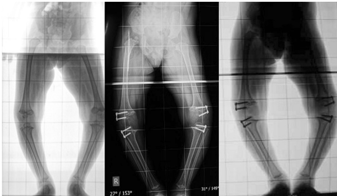
Fig. 4 Radiographs showing failure of correction of deformity in a case of skeletal dysplasia managed with eight plate (8 months and 2 years post-operatively)

extrusion). Two knee joints (6.5 %) in the eight plate group required additional procedure because of failure of correction. Continuing staples for more than 2 years carries the risk of permanent physal failure [9]. This complication has not been reported with figure of eight plate. Thus, we consider it wise to remove the implants if deformity persists for more than 2 years. All patients were screened for limb length discrepancy pre-operatively. Pre-operatively, no patient had discrepancy of more than 1 cm. Three patients in the staple group (two unilateral idiopathic genu valgum, one unilateral post rachitic genu valgum) developed shortening of the affected limb of more than 1 cm, while in the eight plate group, two patients with unilateral idiopathic genu valgum developed limb length discrepancy of more than 1 cm. However, this was statistically insignificant. These patients were given appropriate shoe raise and were advised to wait till skeletal maturity for appropriate intervention. A few patients/parents were concerned about implant prominence, and reassurance was all that was required. Staple extrusion occurred in two knees (Fig. 5), while the eight plate group did not show any implant-related complications.