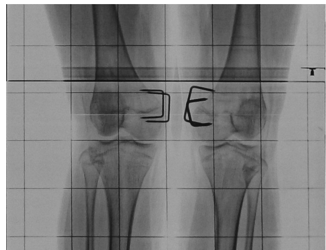
Fig. 5 Radiograph showing complication of stapling (migration) 4 months post-operatively

Blount (1948) introduced staples as a means to achieve temporary hemiepiphysiodesis [4]. Although widely used and considered safe, several reports have documented the