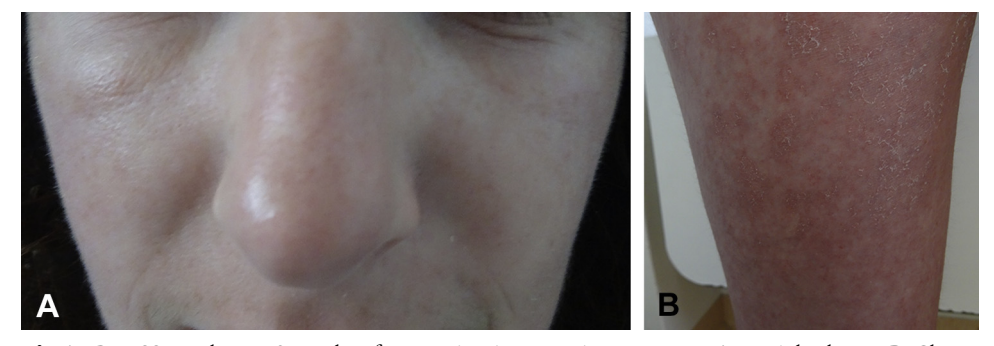
Fig 1. DRESS syndrome 2 weeks after starting ivermectin treatment. A, Facial edema. B, Closeup view of erythematous, edematous, and exfoliative dermatitis on the thigh.