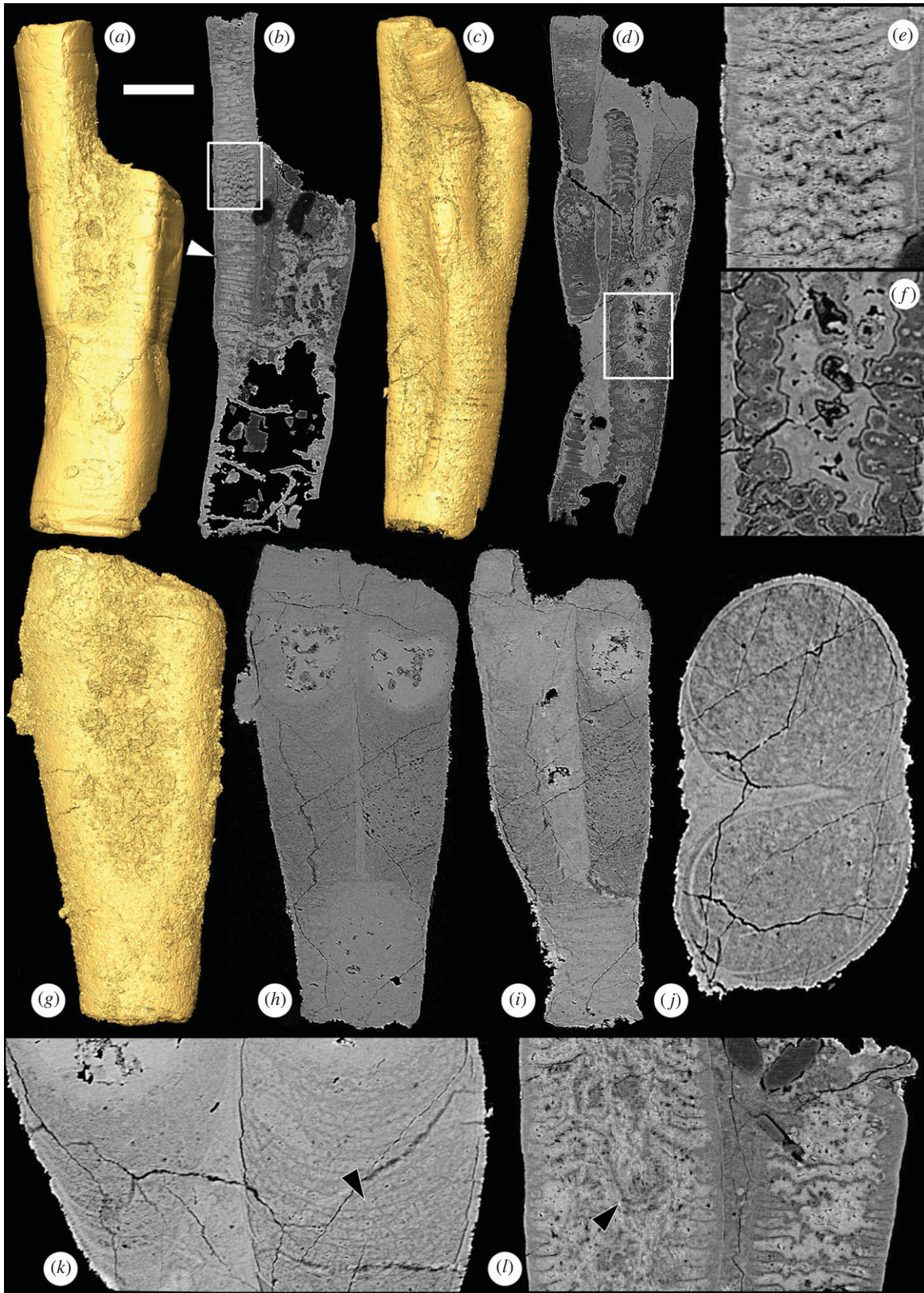
Figure 2. SRXTM images of the tubular fossil Ramitubus . (a) SRXTM surface model of Ramitubus , X 5325, showing ductile deformation of the tube; (b) longitudinal SRXTM section through the specimen in (a) showing ductile deformation of the crosswalls, the arrowhead indicates a region where there are several successive compartments of lower than average height, the region in the box is enlarged in (e); (c) SRXTM surface model of Ramitubus , X 5326; (d) longitudinal SRXTM section through the specimen in (c) showing organic degradation of the cross walls, the region in the box is enlarged in (f); (e) higher magnification image of boxed region in (b); (f) higher magnification image of boxed region in (d) showing cross walls truncated by an irregular region of void-filling cement; (g) SRXTM surface model of Ramitubus , X 5327; (h) longitudinal SRXTM section through the specimen in (g), note the high-attenuation (bright), nearly spherical structures towards the end of each branch; (i) longitudinal section through the specimen in (g) at a different level, note the change in the pattern of the cross walls after branching; (j) transverse SRXTM section through the specimen in (g); (k) higher magnification SRXTM section of the specimen in (g) showing finer layers between the cross walls, the arrowhead shows a region where these layers are made up of sub-angular structures; (l) longitudinal SRXTM section through the Ramitubus specimen in (a), the arrowhead indicates down-folding of a cross wall that results in a prominent pocket-like space towards the centre of one of the specimen. Scale bars: (a,b) 183 \mu\text{m} ; (c,d) 126 \mu\text{m} ; (e) 48 \mu\text{m} ; (f) 40 \mu\text{m} ; (g–i) 89 \mu\text{m} ; (j) 36 \mu\text{m} ; (k) 36 \mu\text{m} ; (l) 64 \mu\text{m} . (Online version in colour.)