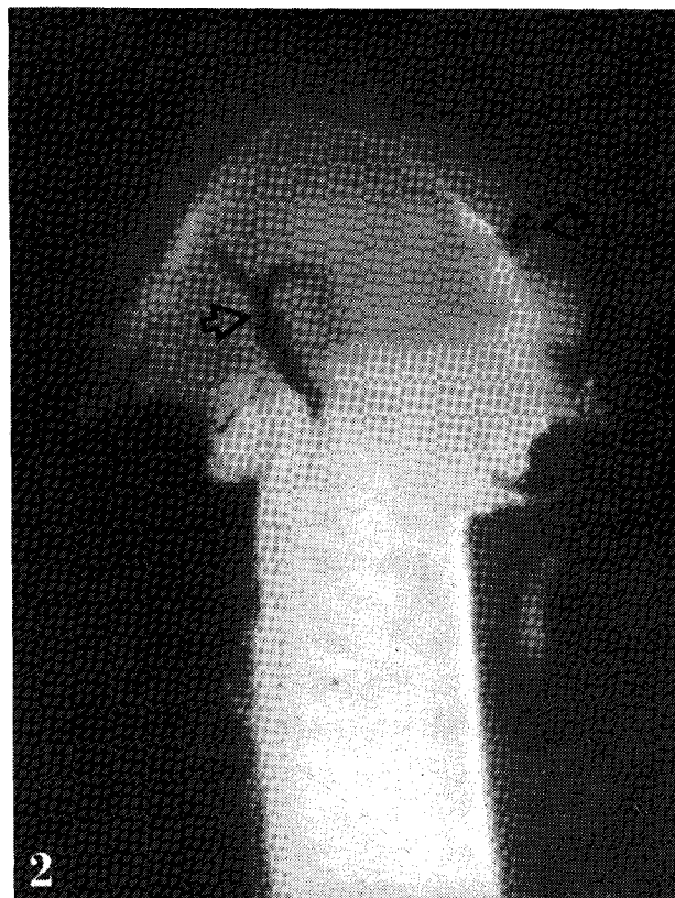
Fig. 2: Low power photomicrograph of an E11 eye sutured to the distal end of the tibial nerve. Diameter of nerve is approximately 1mm. Arrows denote sutures.

(Ausjena) and jeweler's forceps, the embryonic eye was sutured to the distal end of the tibial nerve. Distal orientation is important since growing axons would enter one side of the nerve and would not get redirected into another fascicular branch (i.e., they will emerge somewhere from the large tibial stump) as may occur in the reverse orientation. Suturing was accomplished by first aligning the eye so that the optic nerve was near the tibial nerve stump. Then, a fine suture needle with attached 8-0 silk thread (G7, Ethicon) was passed through one side of the scleral portion of the eye, and then through the perineurium at the distal stump end of the tibial nerve segment. By gently pulling the suture, the eye closely apposed the nerve and a single tie held the two together. A similar suture firmly attaches the opposite side of the eye to the nerve stump (see Figure 2) so that the optic nerve is abutted against the stump of the tibial nerve. As