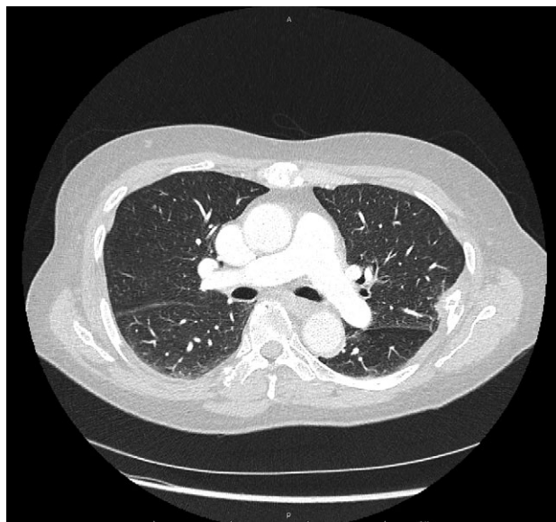
Figure 3: CT pulmonary angiogram performed in February 2016 revealed near-complete resolution of pulmonary nodules, pleural thickening and pleural effusion.

those who have received solid organ transplantation [4]. The risk of TB infection in transplant patients is at least 30 times higher than that of the general population [5]. Most UK centres routinely offer prophylactic anti-tuberculous therapy for transplant patients at higher risk of developing TB.