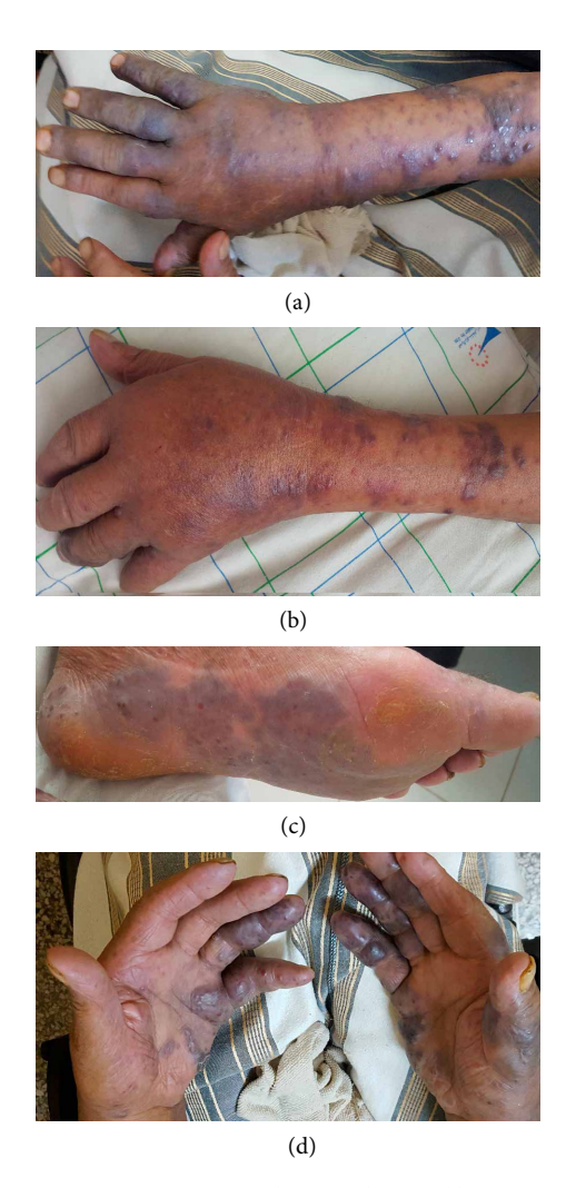
FIGURE 1: (a) Forearm cutaneous lesions. (b) Hand lesions extension. (c) Plantar cutaneous lesions. (d) Palmar cutaneous lesions.