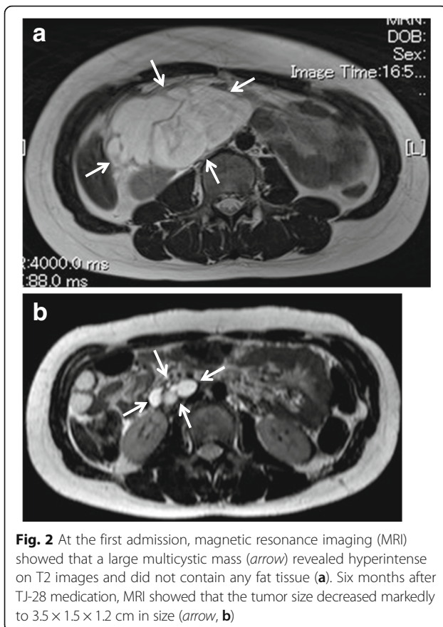
Fig. 2 At the first admission, magnetic resonance imaging (MRI) showed that a large multicystic mass (arrow) revealed hyperintense on T2 images and did not contain any fat tissue (a). Six months after TJ-28 medication, MRI showed that the tumor size decreased markedly to 3.5 \times 1.5 \times 1.2 cm in size (arrow, b)

has anti-inflammatory effects. Therefore, TJ-28 is usually used to treat edema, excessive sweating, thirst, and decreases in urine volume. In addition, recently, several investigators have reported on the effectiveness of TJ-28 in treating LMs [7, 8]. The purpose of TJ-28 usage in LMs was to regulate and reduce cystic fluids. Ogawa-