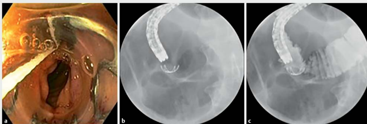
► Fig. 2 Radiologic and endoscopic pictures from patient 2. a Over-the-scope-clip mounted on the tip of the scope before application; b Fluoroscopic image obtained right after placement of OTSC. c Contrast injection showing no leak after the application of OTSC