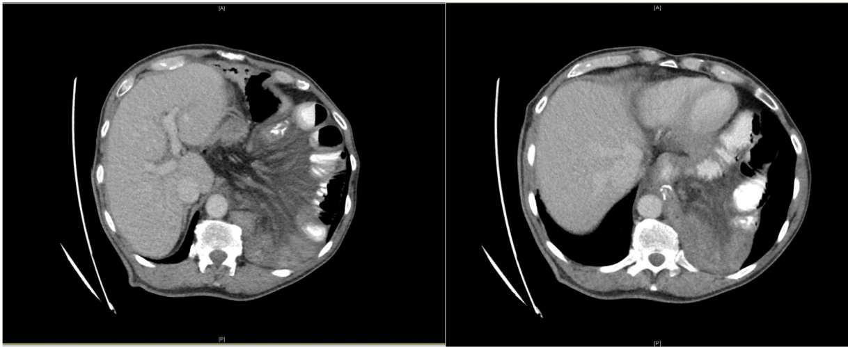
Figs. 1 and 2. Incarcerated hiatal hernia in 66-year-old man postgastrectomy.

Axial CT Abdomen with intravenous contrast shows incarcerated hiatal hernia into the left pleural cavity containing esophagojejunostomy and dilated jejunal loops