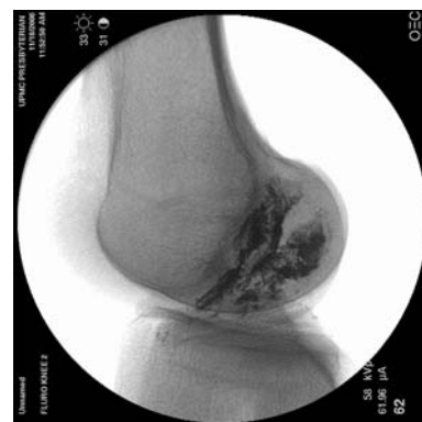
Fig. 2 Lateral radiograph at 0° of knee flexion

The most important finding of the present study was that the visualization of the femoral attachment sites of both