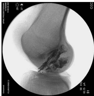
Fig. 3 Lateral radiograph at 30° of knee flexion