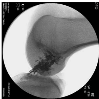
Fig. 5 Lateral radiograph at 90° of knee flexion

bundles changes with different degrees of knee flexion and that the centers of the AM and PL bundle are horizontally aligned when the knee is flexed beyond 90°. As described in the literature, we found the orientation of the AM and PL bundle to be parallel in the sagittal plane with the knee at full extension, and twisted as the knee was flexed toward 90° [7, 12, 16]. This observation is a critical point for surgical considerations, because of the flexed knee position used during standard arthroscopy. Consistent with the existing literature, we found the femoral insertion site of