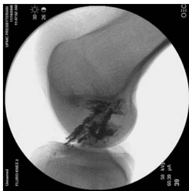
Fig. 4 Lateral radiograph at 60° of knee flexion