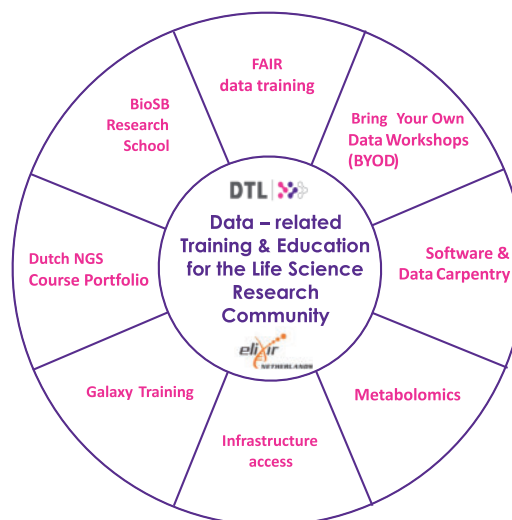
Figure 3. Overview of current themes in the DTL Learning/ELIXIR-NL Training Programme.

The school's mission is to offer PhD students and postdocs a stimulating and interactive environment for their scientific development and education in integrative bioinformatics and systems biology. In addition, BioSB is the national platform in which the Dutch community of researchers in bioinformatics