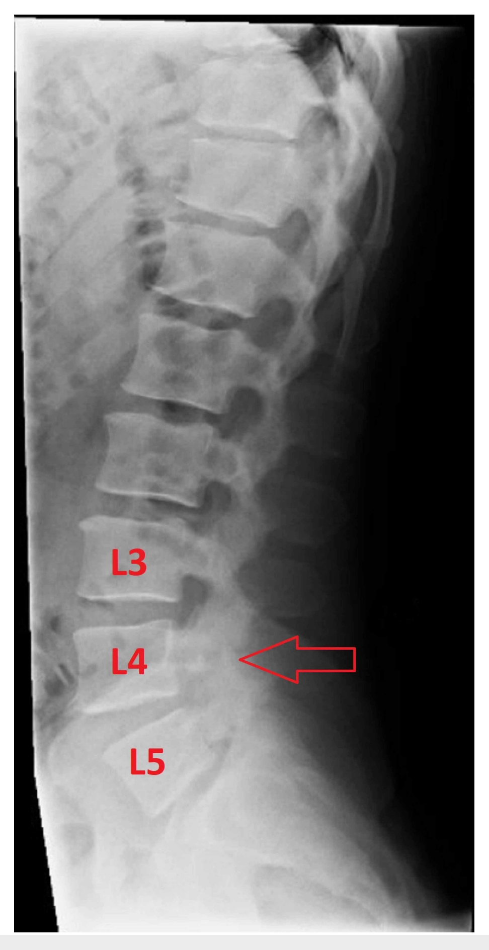
FIGURE 2: Lateral X-ray of the lumbar spine