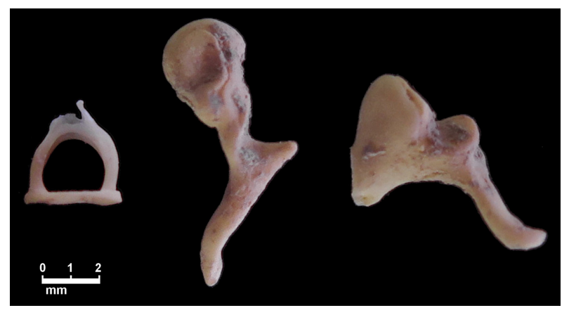
Figure 1. The three auditory ossicles. From left to right , the stapes, malleus, and incus.

development and characteristics over the course of an individual's lifespan (Rolvien et al. 2018). In contrast to the majority of the human skeleton, but similar to the cochlea, the auditory ossicles present with their final size and morphology at birth following the onset of ossification of between 16 and 18 wk in utero and the completion of ossification around the 24-wk gestational age (Marotti et al. 1998; Yokoyama et al. 1999; Cunningham et al. 2000; Duboeuf et al. 2015; Richard et al. 2017). The ossicles and co-chlea appear to follow the same developmental pattern of rapidly increasing bone volume through cortical thickening and densification, along with mineralization of the bony matrix (Richard et al. 2017).