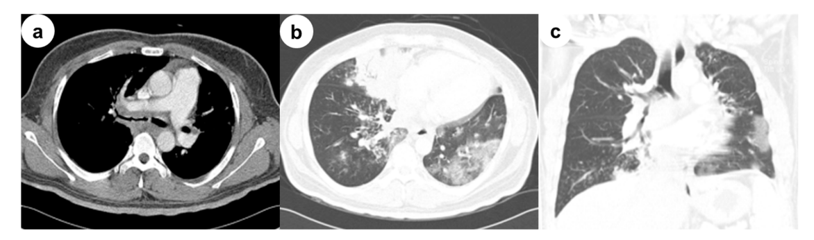
Figure 1. Initial contrast chest computed tomography (CT). ( a ) Selected axial image of the soft-tissue window on chest CT shows the thickening of the right main bronchus, a peribronchial soft-tissue lesion and lymphadenopathy; ( b ) Selected axial and ( c ) coronal images of the lung window on chest CT shows consolidation in the right middle lobe, diffuse and patchy densities with focal consolidations involving both lower lobes, and thickening of the right main and intermedius bronchi.