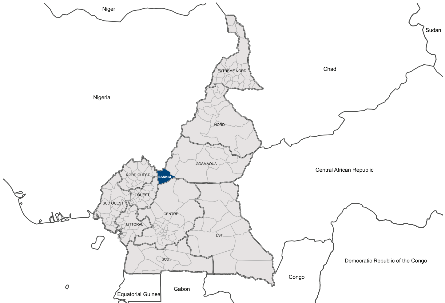
Fig 1. Map of Bankim district, Cameroon.

https://doi.org/10.1371/journal.pntd.0005557.g001