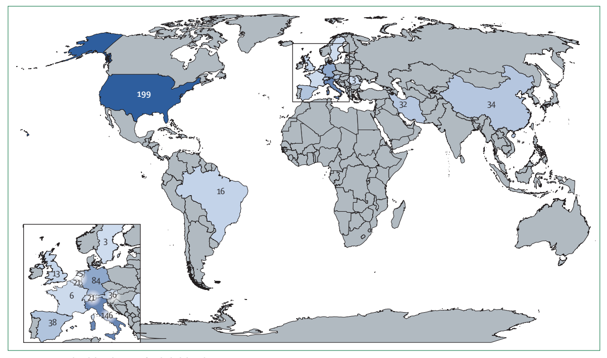
Figure 2: Geographical distribution of included decedents

Table 1: Summary of studies meeting criteria for data extraction