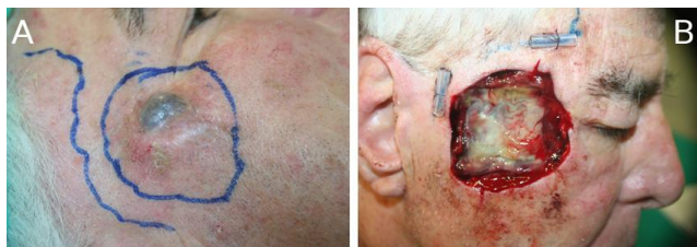
Figure 4: Before (A) and during (B) the Mohs surgery

Unfortunately, due to the relative rarity of SEDC, there have been no randomised studies comparing the traditional surgery with the Mohs Surgery (or other surgical treatments). However, a recent review [5] considers the three cases in the literature of SEDC treated with Mohs Surgery and highlighted the efficacy of this surgical modality for this type of a tumour (Figure 4 A, B).