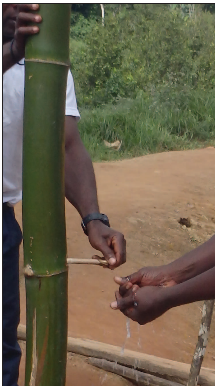
FIGURE 2. Residents use one of the bamboo hand washing stations* that were erected to improve health care practices at entrances to hospitals, county checkpoints, and in towns — Liberia, August 2014

* The diaphragms in the upper part of the bamboo stem are perforated to create a tube that can be filled with water. A hole is drilled just above the lowest intact diaphragm, then plugged with a small stick. The plug is removed to produce a stream of water.