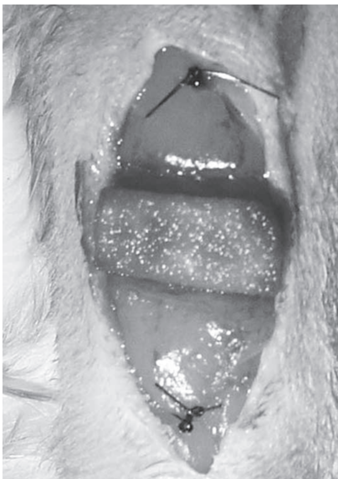
Figure 1 – Muscle repair and absorbable gelatin sponge soaked in bone marrow centrifugate on the lesion of the right tibialis anterior muscle.

The surgical wound was sutured by planes using 4.0 mononylon suture thread and occluded with a sterile impermeable dressing. The same procedure was carried out in the left tibialis anterior muscle;