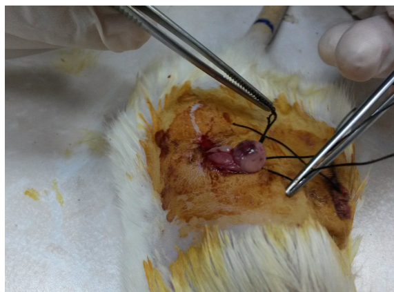
Figure 1 Torsion model performed in ovaries.

Tissues were fixed in formalin, dehydrated by alcohol, cleared in xylene and put in paraffin blocks. Fragments 5 \mu\text{m} thick were cut and hematoxylin and eosin staining was performed. They were analyzed and photographed by the same pathologist in a blind manner using a Leica DM