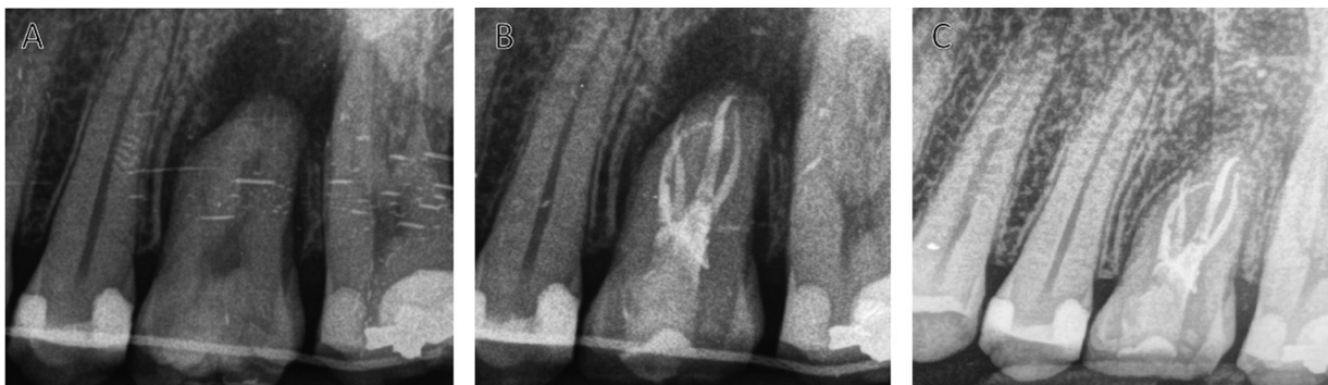
Fig. 3: A. Periapical radiography after surgery. B. Periapical radiography and a root canal treatment after 7 days of the surgery. C. Radiographic control after 12 months of follow-up. PL conservation and bone formation around the root and interproximal bone maintenance can be observed.

Recent studies have reported high success rates both in the short term and in the long term, even for mature teeth (4). It should be noted that most studies have focused on autotransplantation of teeth with incomplete root formation, which restricts the applications of dental autotransplantation to young patients. However, all the previous