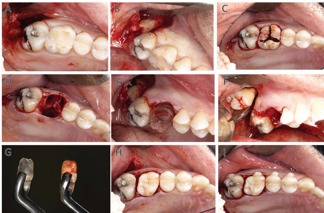
Fig. 2: A-I: Step-by-step of surgical procedure.

A syndesmotomy of the soft tissues and periodontal ligament around tooth 2.6 was performed. The exodontia was completed with odontosection, luxation and