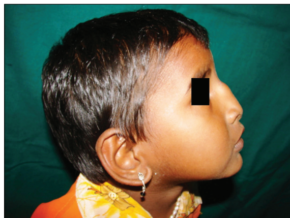
Figure 3: Lateral view showing convexity of swelling over dorsum of the nose