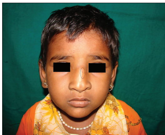
Figure 1: Frontal view photograph showing swelling on dorsum of the nose and mild depression in midline. Note the presence of a punctum at dorsum of the nose (ellipse)

Craniofacial clefts were classified by Tessier in 1973 based on his personal experience yielded by clinical, radiologic, and surgical observations. The exact incidence is not known, but estimates range from 1.4 to 4.9 per 100,000 live births. [2,3] These clefts are found along the lines of fusion of different processes responsible for development of face during the first 8 weeks of life. Tessier craniofacial clefts may involve