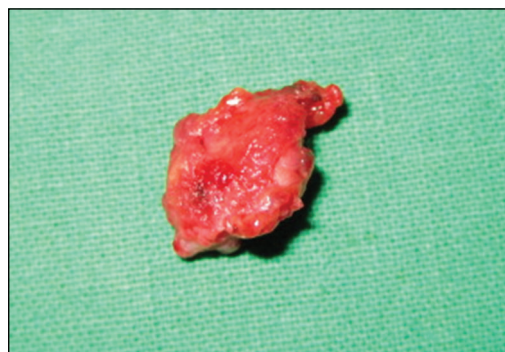
Figure 6: Surgical specimen of excised dermoid cyst

From a surgical point of view for managing Tessier's 0 cleft, even microform clefts may be disfiguring. When planning to