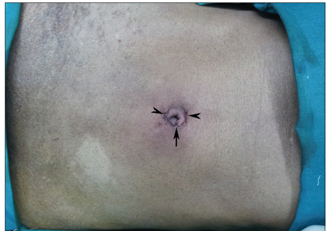
Figure 4: Post-operative umbilicus. Note near-invisible scars of 10 mm port (arrow) and 5 mm ports (arrow-heads)