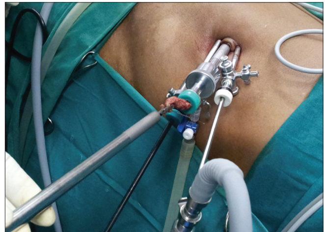
Figure 2: Port position. 10 mm camera-port at 5 O'clock position and two 5 mm working ports at 7 and 12 O'clock. Appendix is being extracted through 10 mm port under laparoscopic vision from 5 mm trocar. Note the position of light cable and port-valves

The laparoscopic trans-umbilical technique described here for appendectomy is a further improvement of standard single-port technique, which is helpful to the surgeons working especially with limited resources in a developing country like India. As only the routine laparoscopic