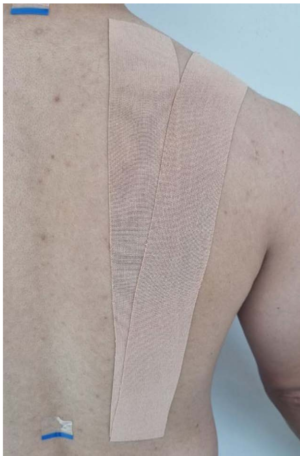
Figure 1. Scapular focused taping.