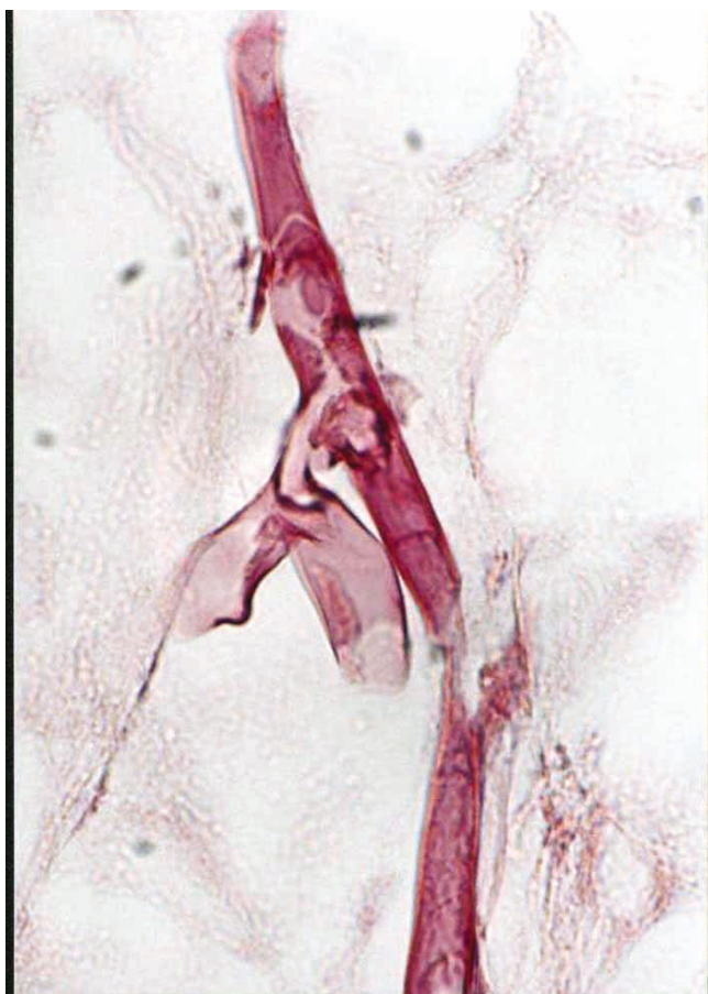
Figure 3 Broad, aseptate and thin walled fungal hyphae having irregular, non-parallel contours, with right angle branching indicative of mucormycosis (PAS × 1000).

disease form, whereas no patient had cutaneous mucormycosis [8].