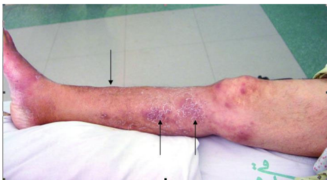
Figure 1 Erythema-nodosum-like lesions of the leg and thigh.

Since a fungal etiology of the skin lesion was established, the involved tissues were surgically resected, followed by intravenous treatment with amphotericin B (1 mg/kg/day). After 7 days of antifungal therapy, the patient's serum creatinine concentration had increased to 2.5 mg/dL; hence we had to decrease the dose of amphotericin B to 0.5 mg/kg/daily, and continue treatment until she had