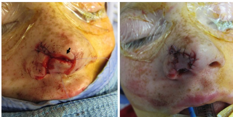
Figure 2. Supermicrosurgery anastomosis of artery only (left, arrow indicates anastomosis site). Right, blueish hue of the replanted tissue at the end of procedure indicating venous congestion.

remained viable (Fig. 4). The outcome was excellent requiring no secondary reconstructive procedure with the last follow-up appointment being 5 years postoperatively (Fig. 5). Patient (13 years old) claimed no one ever noticed the injury on his nose nor is he conscious of it.