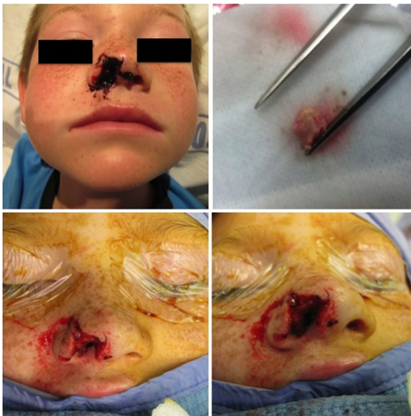
Figure 1. Dog bite amputation of right nasal tip and alar that included several nasal subunits (partial nasal tip, medial third of right alar, and the soft triangle). Top left, amputated nasal tissue. Bottom right and left, intraoperative pictures showing the size of nasal defect.