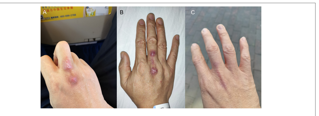
FIGURE 1 | Photos of the patient's right hand. (A) Poorly healed primary wound and secondary lesion at the back of the right hand. (B) Ulcerated lesions at the back of the right hand. (C) Healed wounds after 9 months of treatment.

When NGS technologies first appeared in the market, they were mainly used for genome sequencing (5). With the advancement of sequencing chemistries and computational capacity, NGS technologies have matured into clinical applications in the recent years (6). In the clinical setting for infectious diseases, NGS is used most often for patients who have fever without localizing features or culture-negative infections (7, 8). In addition, it is also useful for rapid diagnosis of infections caused by slow-growing microorganisms. For example, we have recently reported its usefulness in rapid diagnosis of fungal infections (9). As for mycobacteria, NGS has been used for the diagnosis of tuberculosis and a number of non-tuberculous mycobacterial infections (10–15). Since many mycobacteria, such as M. chimaera, M. yongonense, M. avium complex, M. kubicae ,