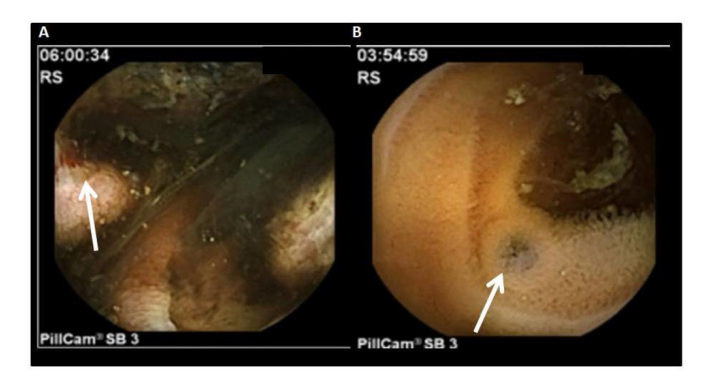
Figure 2 Video capsule endoscopy. (A) Ulcerated melanoma metastasis. Active bleeding (arrow). (B) Pigmentation of the mucous membrane in keeping with melanoma metastasis.

Haemorrhagic small bowel melanoma metastases are a very rare cause of GI bleeding. Small bowel involvement is found postmortem in 50%–60% of melanoma patients,<sup>7</sup> and only 10% are diagnosed premortem. The most common location of small bowel melanoma metastases is the terminal ileum, followed by the stomach. The most common manifestation is