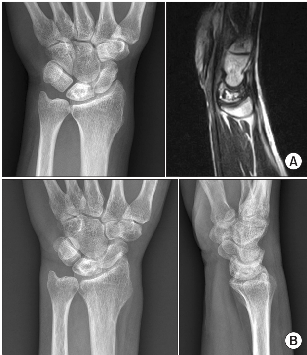
Fig. 4. Wrist pain in a 57-year-old man, mainly located on the ulnar side of the wrist. (A) The plain radiograph showed a large cystic lesion in the lunate and a positive ulnar variance. Magnetic resonance imaging showed a geographic bone lesion surrounded by low-signal rim inside the lunate, indicative of Kienböck's disease (Lichtman stage 2). (B) Follow-up of 7.2 years resulted in no further collapse in the lunate and no arthritic involvement. Intermittent pain control and lifestyle modification of avoiding the pronated position of the forearm resulted in favorable clinical outcome.

nate angle. Absence of sclerotic or cystic changes and of fragmentation, 22) and normalization of the trabecular patterns inside the lunate 23) have also been related to favorable treatment outcome. Lastly, lunate tenderness to palpation can be checked for both diagnosis and treatment monitoring in physical examination, 24) where its disappearance could be found in our consecutive series at the last follow-up visits.