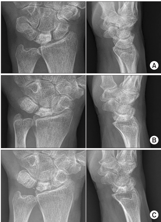
Fig. 1. Wrist pain persisted for 5 years in a 66-year-old woman. (A) Plain radiographs showed Kienböck's disease (Lichtman stage 3A) and chronic synovitis at the dorsum of the wrist. For the latter condition, passive stretching exercise and pain control using nonsteroidal anti-inflammatory drugs were recommended. (B) One year later, apparent collapse of the lunate with persistent radiographic sign of the synovitis could be found. (C) After continuous observation of additional 4.7 years, the lunate did not collapse further, with radiographic signs of the synovitis no longer apparent. Intermittent pain of twice a month was the only remaining symptom.

the same 14 patients, and the remaining 13 patients were interviewed by telephone. Improvement in pain was found in all 27 patients, none of whom had undergone surgical treatment for Kienböck's disease. The average VAS was 0.8 (range, 0–2) at the last follow-up ( p = 0.001 ). Clinical results were excellent in 22 patients and good in 5 patients according to Dornan's criteria. 12) The average percentage grip strength at the last follow-up was 85% (range, 74%–102%). The final ROM of the wrist was 41° (range, 20°–60°) for extension and 41° (range, 20°–65°) for flexion. When compared to the initial measurements, there was no statistically significant difference in both extension (32° vs. 41°, p = 0.054 ) and flexion (36° vs. 41°, p = 0.079 ). Focal tenderness of the lunate, which was present at the