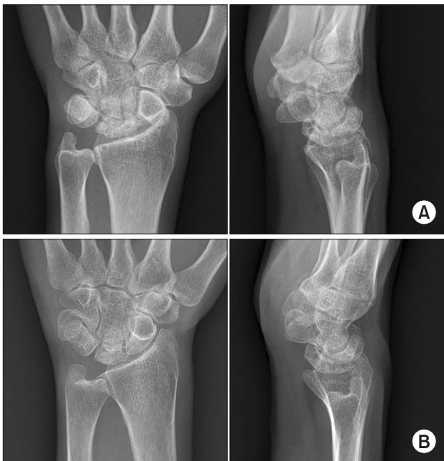
Fig. 3. A 50-year-old woman underwent carpal tunnel release and her concomitantly found Kienböck's disease (Lichtman stage 3B) was closely observed for its clinical and radiographic progression. (A) Initial radiographs showed collapse of the lunate with evident sclerotic change. (B) Radiographs taken 10.7 years after the diagnosis showed an apparent increase in the height of the lunate. Note the trabecular pattern inside the lunate, which became similar to that of other carpal bones. Intermittent pain existed, but the patient was satisfied with not having undergone surgery for Kienböck's disease.

to prove this hypothesis. Furthermore, diminished vulnerability to collapse is also not explained if osteoporosis is a predisposing factor. Otherwise, ulnar variance becomes more positive as aging. 15 A positive ulnar variance, which diminishes the axial loading of the radius, 16 may act as a protective factor for the lunate collapse. Although data