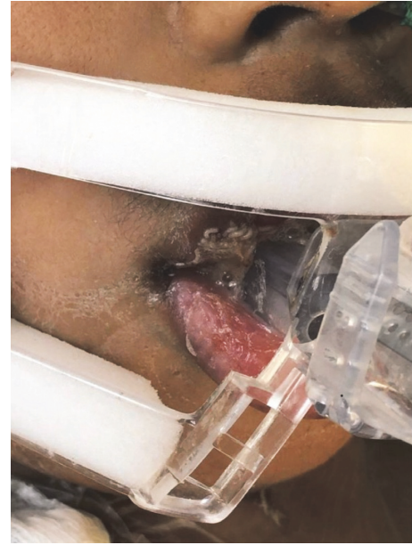
FIGURE 1: Patient's with nosocomial myiasis. Presence of larvae between upper lip and tongue.

The entomology laboratory at the InDRE used these slides (magnified to 4x and 10x) and a SZX7 stereoscope and an Olympus BX43 optical microscope to identify the species of the larvae using their morphological characteristics. A literature review was performed to inform the taxonomical differentiation of these specimens against other members of the Oestroidea superfamily, especially the Calliphoridae, Cuteribridae, and Oestridae families. The characteristics that differentiated Calliphoridae family from other families were the following: body cylindrical and tapering; cephaloskeleton