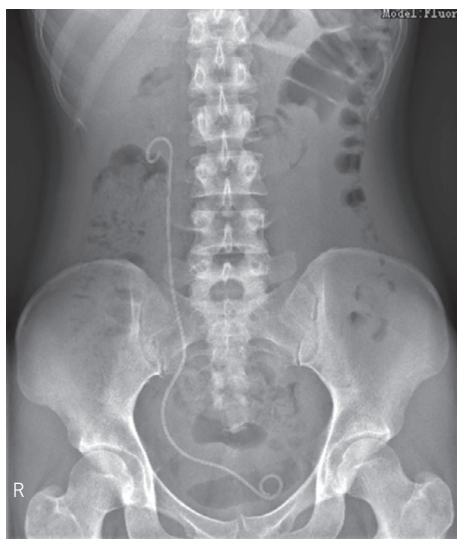
Fig. 3 Kidney, ureter, and bladder radiography on postoperative day 1.

treatment is not easy when a patient with a history of Cohen reimplantation has symptoms due to upper urinary tract stones. Some investigators had some challenges of retrograde approach for patients postoperative Cohen reimplantation like inserting a catheter through a supra-pubic tract under cystoscopic vision, using a curved-tip angiographic catheter or cobra head catheter under cystoscopic guidance (Table 1). Conversely, percutaneous antegrade approach for such a patient was limited. We selected the percutaneous antegrade approach using a fURS with UAS for the distal ureteral stones in this case because of failed retrograde insertion of the guide wire to the ureteric orifice by using flexible cystoscope. To the best of our knowledge, only seven reported cases, including the present case, have utilized the percutaneous antegrade approach after Cohen reimplantation.