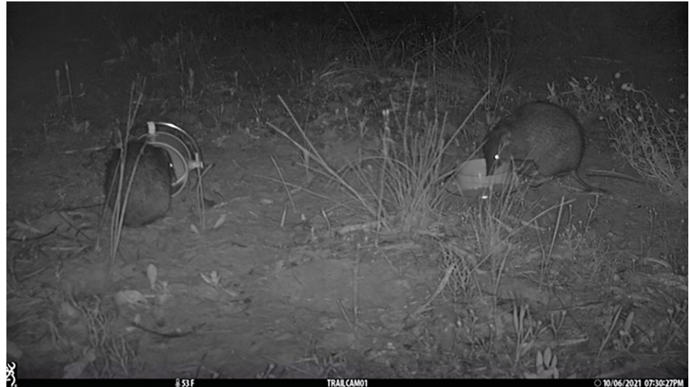
Fig 3. Quenda entering feeding stations (PVC pipes) through an RFID logger antenna allowing them to be uniquely identified.

https://doi.org/10.1371/journal.pone.0276388.g003