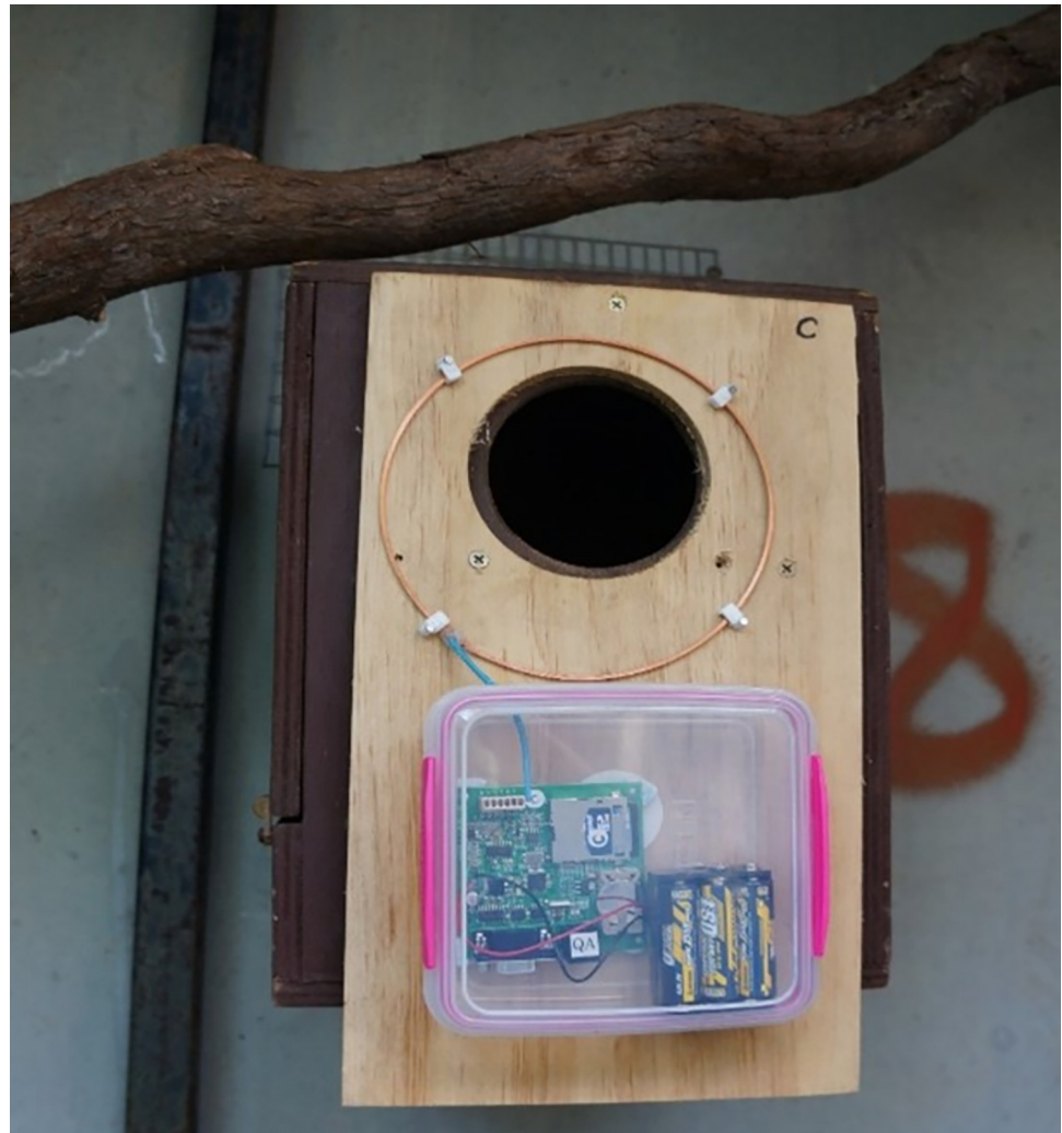
Fig 2. RFID logger (inside weather-proof housing) attached to a nestbox for Northern quolls with the RFID antenna placed around the entrance.

https://doi.org/10.1371/journal.pone.0276388.g002