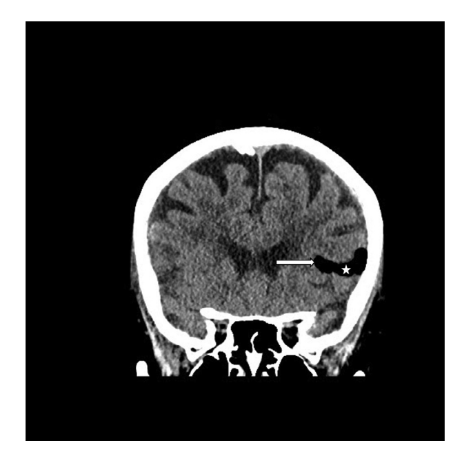
Fig. 1 – Coronal reconstruction CT showing gas (star) within the patient's left sylvian fissure (arrow).