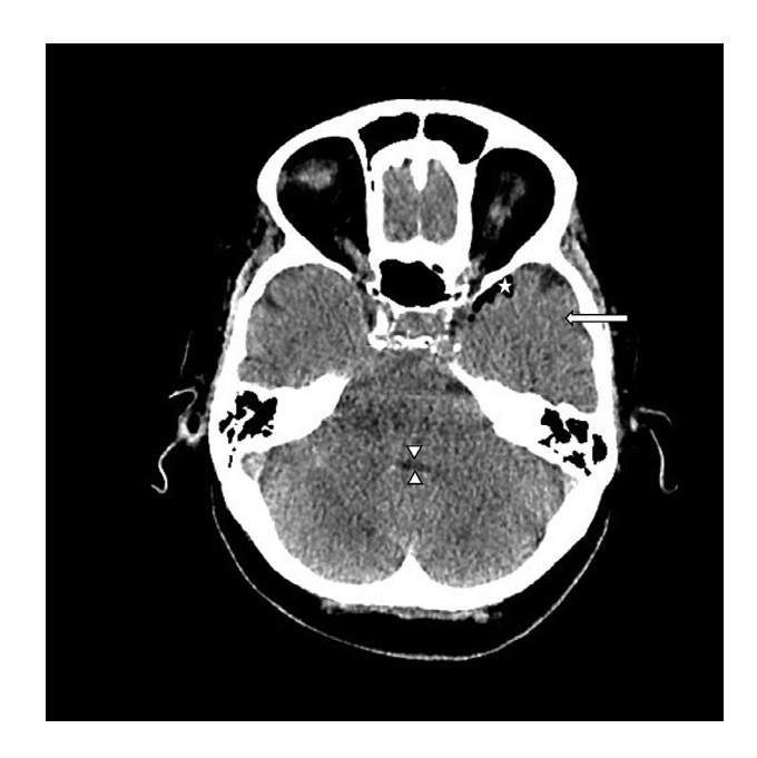
Fig. 3 – Axial CT scan showing gas (star) adjacent to the left temporal lobe (arrow). The fourth ventricle (arrowheads) appears partially effaced.

A CT of her brain was ordered which revealed scattered intracranial gas, particularly suprasellar region, and left hemisphere (Figs. 1,2, and 3). There was no evidence for a depressed skull fracture or air cell disruption. The sylvian fissures and interpeduncular cistern were all dense in appearance. The patient's fourth ventricle appeared partially effaced with some developing downward herniation of the cerebellum. The total estimated intracranial air was 5 milliliters. A differential considered in the report includes a subarachnoid hemorrhage or complex and/or proteinaceous material, perhaps in the setting of infectious and/or inflammatory processes such as meningitis. Part of the density along the sylvian fissures could be from some component of sulcal effacement giving this dense appearance, and or from the courses of the middle cerebral arteries.