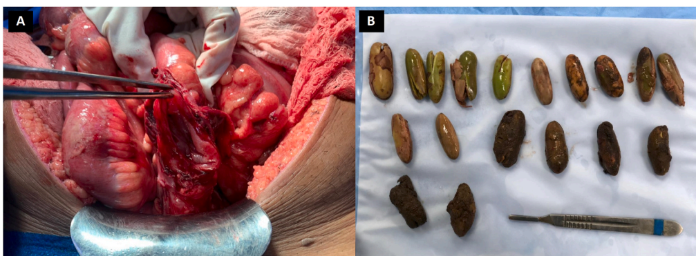
Fig. 2. (A) Intraoperative image of a lesion in the anterior wall of rectosigmoid transition. (B) Visualization of Inga laurina seeds after abdominal cavity removal.