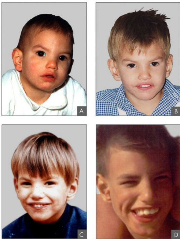
Figure 1 Clinical features of a patient with Cri du Chat syndrome at age of 8 months (A), 2 years (B), 4 years (C) and 9 years 6/12 (D).

Myopia and cataract have been reported. Hypersensitivity of the pupil to methacholine and resistance to mydriatics, probably due to a defect of the pupil dilator muscle, have also been described [29,30]. These features have also been found in four patients with Goldenhar's syndrome associated with CdCS [31,32]. Scoliosis, flat foot, pes varus, inguinal hernia and diastasis recti are frequent. Two patients with joint hyperextensibility, skin hyperelasticity and other features of Ehlers-Danlos syndrome [5], and one patient with both clinical manifestations of CdCS and Marfan syndrome have been reported [33]. A patient with a small deletion in 5p15.33 and phenotype suggesting Lujan-Fryns syndrome has been described [34].