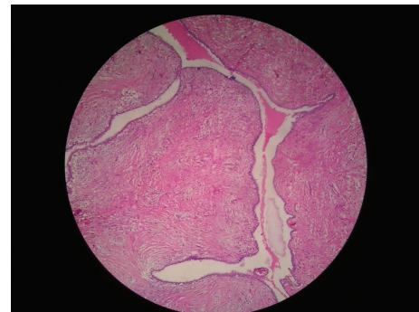
FIGURE 4: Histological analysis of the surgical specimen demonstrated stromal and epithelial components arranged in undulating configuration with several slit-like spaces and crevices. The protrusion of the stromal part into the ductal lumen gives it the characteristic “leaf-like” appearance (H & E).

and vascularity. Chest X-rays and abdominal ultrasound were performed which showed no abnormality. Fine-needle aspiration cytology was inconclusive. We suspected a case of Phyllodes tumor owing to the nature and rapid growth of the breast mass and planned an excisional biopsy. The patient underwent wide excision of the mass under general anesthesia; we took a one-centimeter margin from the clinically palpable periphery of the tumour (Figures 2 and 3). The resected specimen was 9.5 \times 8.5 \times 4.5 cm in size and the tumor was not invasive to the surrounding tissues. The specimen was sent for histopathology macroscopic examination evidenced a nodular mass with irregular and ulcerated surface. The anatomopathologic analysis of the surgical specimen revealed epithelial-lined cystic spaces into which the hypercellular stroma was projected, the stroma cellularity was low with mild pleomorphism and low mitotic activity, features compatible with benign Phyllodes tumor (Figure 4), confirming the initial diagnosis.