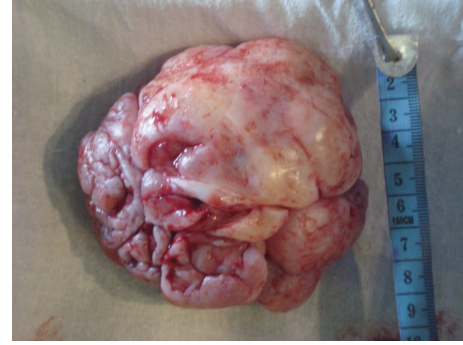
FIGURE 3: The resected specimen was firm in consistency and was found attached to the underlying structures by a stalk-like process. The resection included one centimeter of margin from the clinically palpable periphery of tumor.

The patient was subjected to diagnostic investigations which included routine as well as imaging and cytological modalities. Blood examination revealed no abnormality except mildly elevated ESR and all other parameters were within normal limits. Ultrasonography reported the mass as an exophytic growth with heterogeneous echotexture