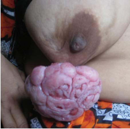
FIGURE 1: Ulcerated fungating mass, with irregular surface and nodular appearance, occupying the lower and outer quadrants of the right breast, at the time of presentation.