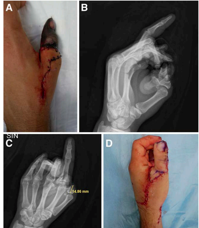
Fig. 3. A, A 28-year-old male patient with a replant failure of left thumb after trauma. B and C, Rx of the defect. D, TGT flap inset immediate postoperative.

Our data have highlighted, once again, the TGT as an aesthetically valid reconstructive option for digit amputations and led to new perspectives in the literature for its application in long finger defect reconstruction. We believe that meticulous preoperative measurements, attention to detail, and a clear reconstructive plan are essential to achieve the best aesthetic outcome. In our