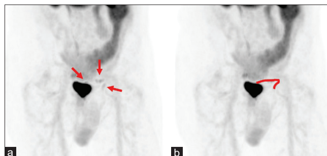
Figure 1: (a) Right anterior oblique maximum intensity projection of the pelvis from a 18 F-DCFPyL PET scan in the 71-year-old male patient with prior history of prostatectomy and previous treatment with androgen deprivation who is described in this case report. Note the curvilinear distribution of radiotracer in the left pelvis (red arrows) that outlines the expected intrapelvic course of the left vas deferens. (b) The same maximum intensity projection as in (a) but with a red line demarcating the approximate location of the intrapelvic left vas deferens

While pathologic confirmation of disease in the patient's left vas deferens is necessary to confirm the diagnosis of PCa, PSMA-targeted agents have been repeatedly shown to have exceedingly high specificities. [8,9] In addition, many of