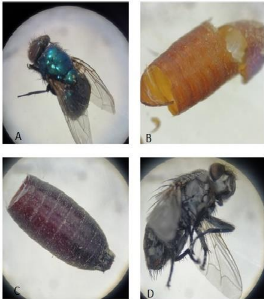
Fig. 4: Adult form of Calliphora spp.(A), stage of pupa of Calliphora spp. (B), stage of pupa of Sarcophaga spp. (C), adult form of Sarcophaga spp. (D) were identified as macro- and microscopically. (Original photos)