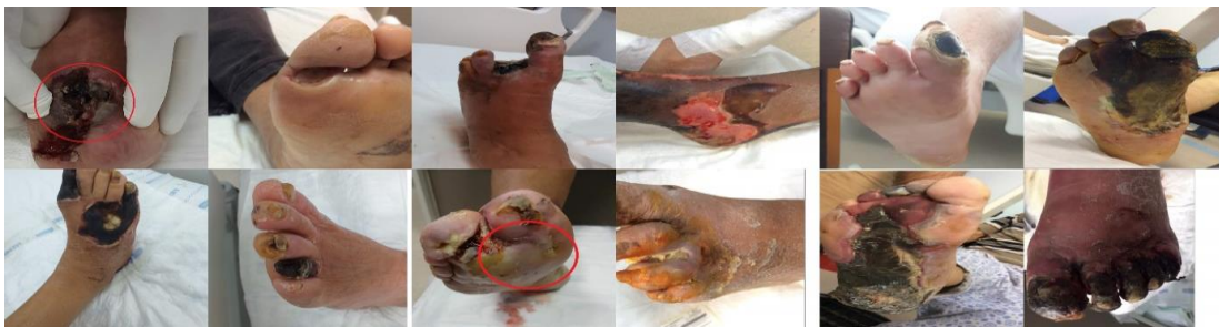
Fig. 1: Twelve myiasis cases with diabetic foot ulcers

The present study included twelve myiasis cases with diabetic foot ulcers in Nazli-Selim Eren Chronic Wound and Infections Care Unit, Aydın, Turkey between 2017 and 2019. Demographic, clinical characteristics of the patients and clinical examination of the wound were recorded (Fig. 1).