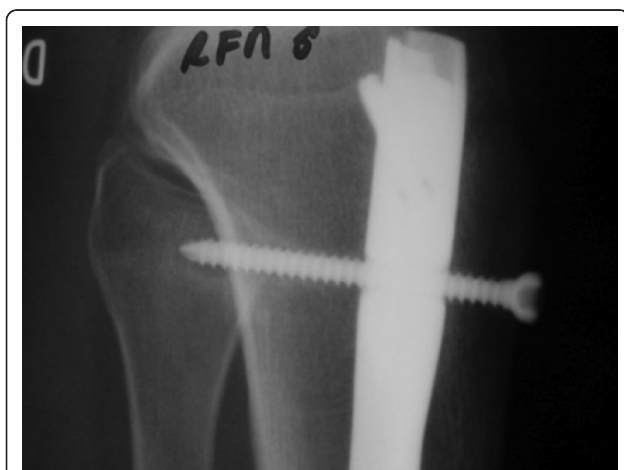
Figure 1 X-ray in lateral view with the oblique screw crossing the proximal tibiofibular joint.

Among a hundred patients treated with intramedullary nailing after tibial shaft fractures, 30% complained of knee pain. A patient lost the computed tomography and was excluded. Performing the computed tomography, it was observed that 20 patients (68.9%) had the proximal screw crossing the proximal tibiofibular joint and 13 (44.8%) had already taken out nail and/or screw. Four patients (13.7%) presented complaints of knee pain although the screw did