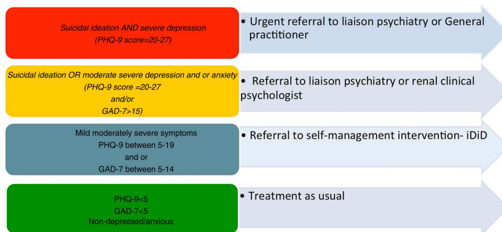
Figure 1 Stratified stepped-care referral pathway for managing psychological distress among individuals attending for haemodialysis.

All patients with mild to moderately severe symptoms of depression and/or anxiety who either: (1) do not meet our remaining study inclusion criteria, (2) choose not to consent into the study, or (3) do not provide consent for us to approach them about the study, will be provided with the option of receiving usual care follow-up from the renal clinical psychology team. Usual