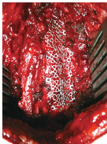
Fig. 1. Implantation of titanium mesh in right open-door side.

Values are presented as mean±standard deviation or number.