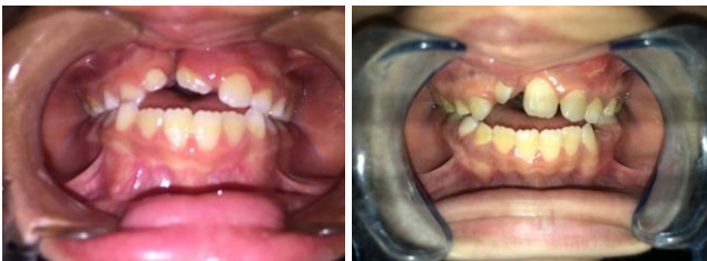
Figure 4: Preoperative cleft site (left); Postoperative cleft site (right)

Following the surgery, all patients were prescribed proper antibiotics, analgesics and anti-inflammatory with oral hygiene instructions and soft food diet. Postoperative clinical evaluation (Figure 4) and radiographic evaluation after 6 months with panoramic x rays (Figure 5) and measuring bone density at graft site from CT and comparing it to the normal side (Figure 6). All data were subjected to statistical analysis.