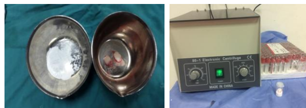
Figure 2: Nano calcium & collagen (left); PRP centrifuge (right)

Surgical procedures: Under GA with full aseptic conditions. A full mucoperiosteal flap was reflected from first premolar region to the central incisor. Separation of oral and nasal layers and closure of fistula was done.