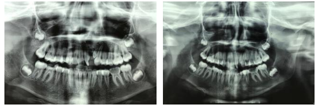
Figure 5: Preoperative panorama (left); Postoperative panorama (right)

difference between the two groups. The difference between the two groups was considered statistically significant when p < 0.05 , and considered highly statistically significant when p < 0.01 .